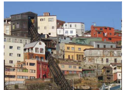
Acensor of Valparaíso