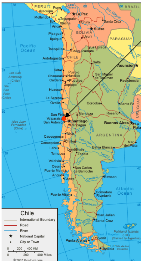
Viña del Mar